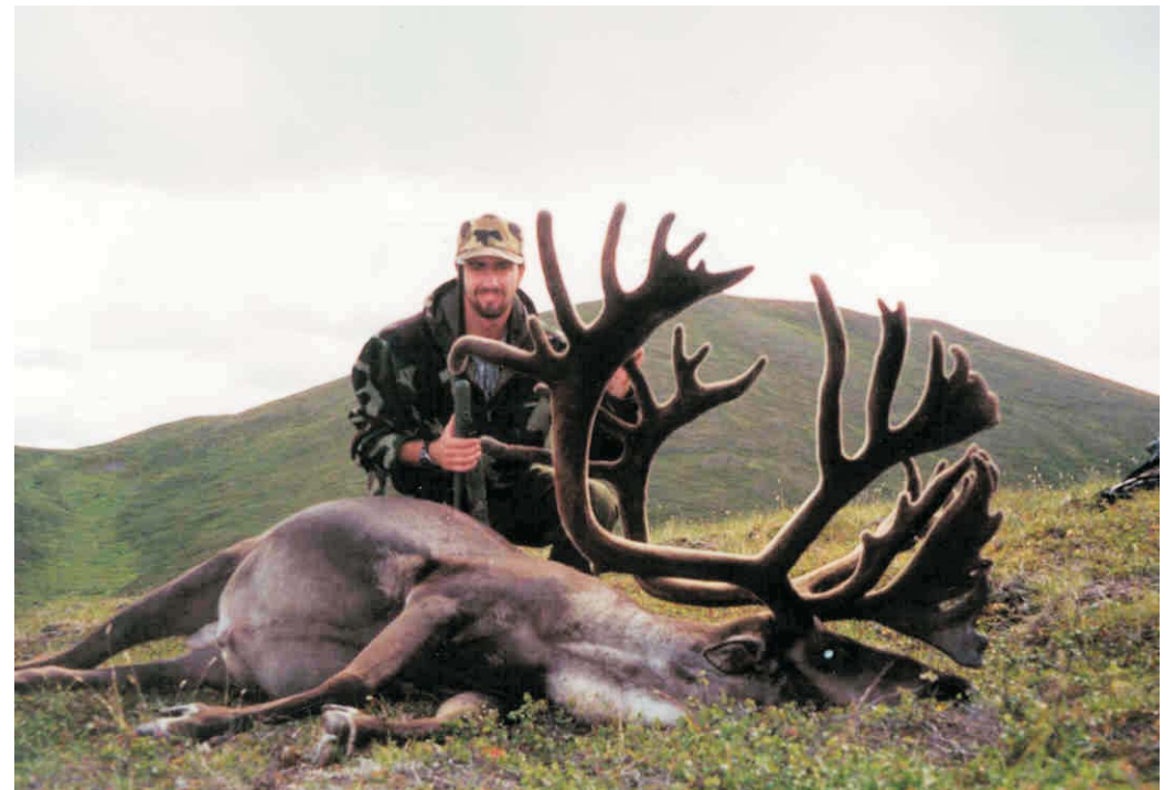
Alaskan Barren Ground Caribou